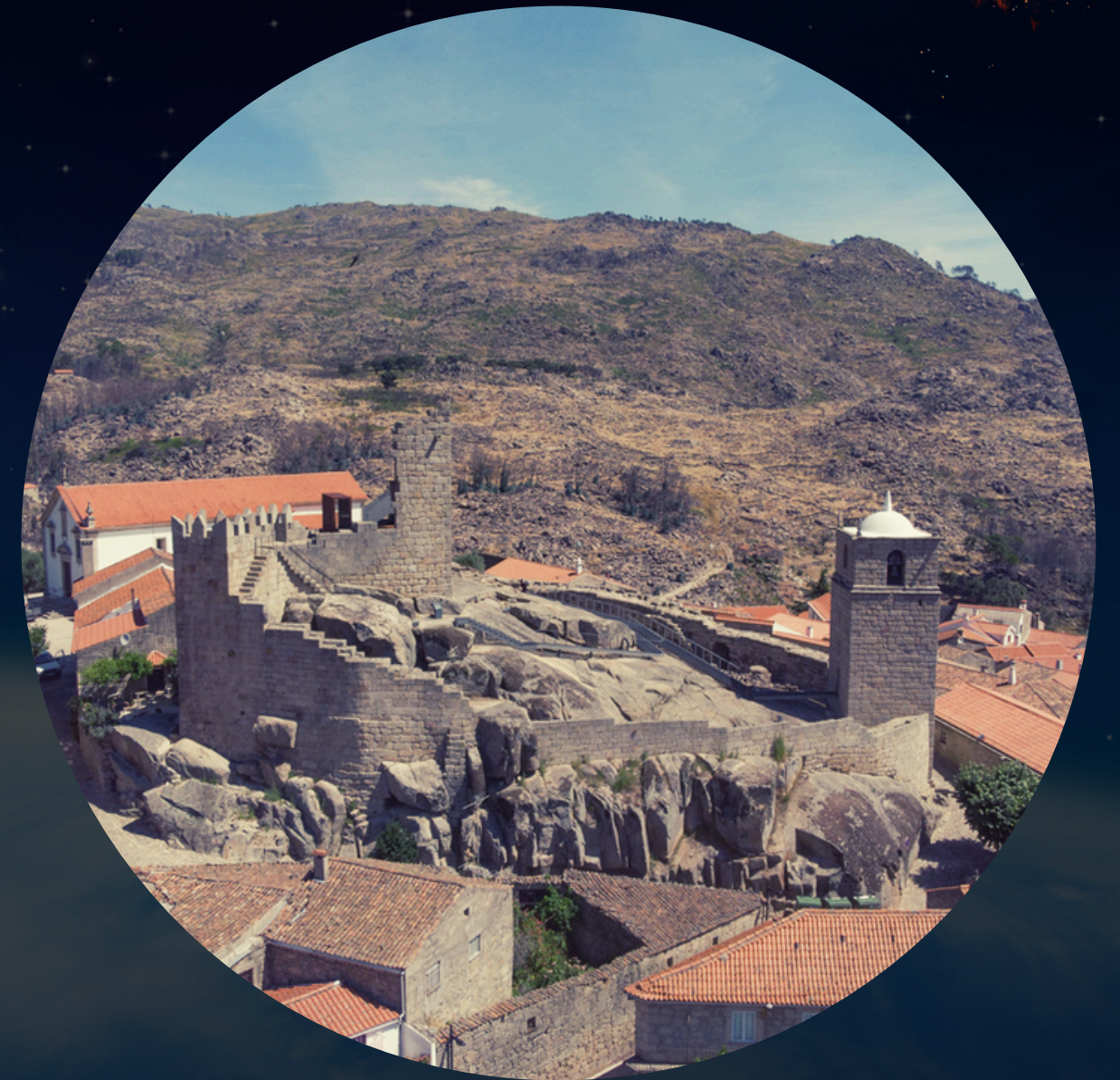
CASTELO NOVO MEDIEVAL CASTLE