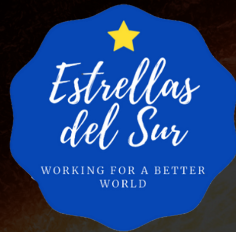
Estrellas del Sur (Spain)