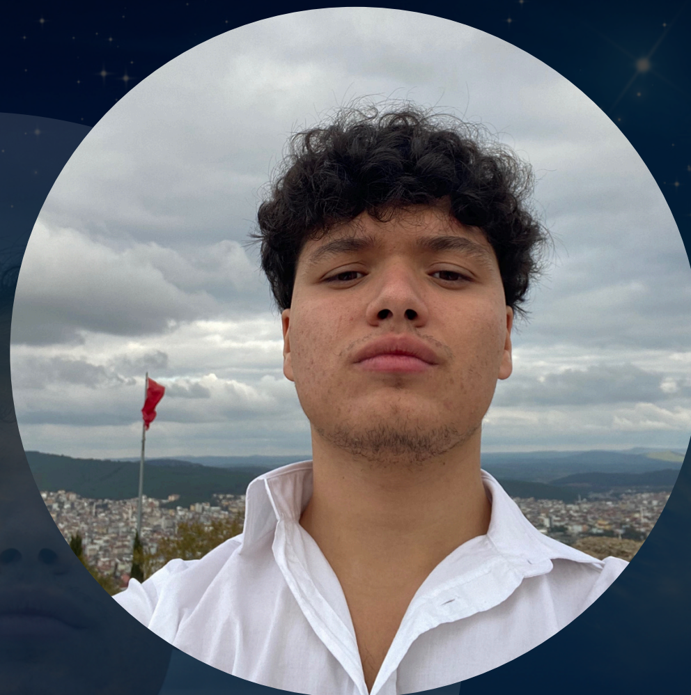
RODRIGO PEDRO PROJECT LOGISTICS AND COMUNICATION