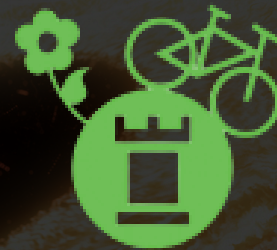
Pozitiva Samobor (Croatia)